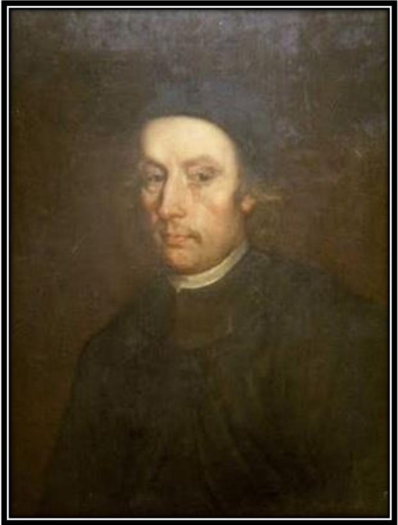
Saint Edmund Arrowsmith 1585 - 1628